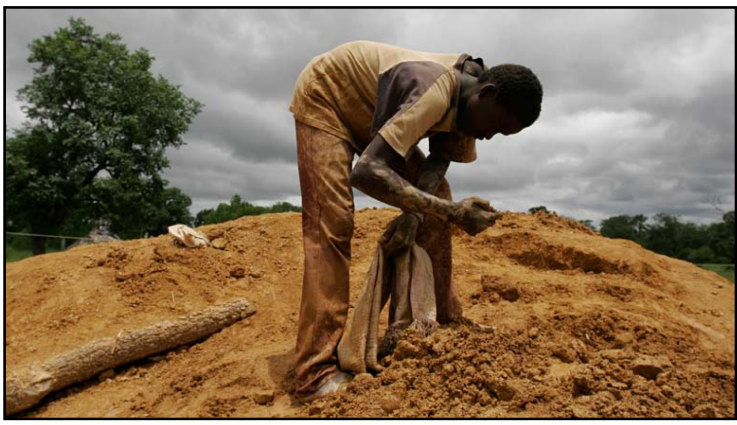
Rebecca Blackwell • AP